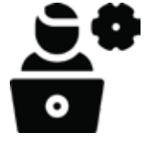
Technicians and IT technicians