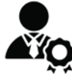
Quality check professionals