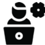
Technicians and IT technicians