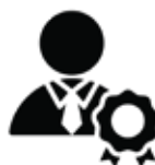
Quality check professionals